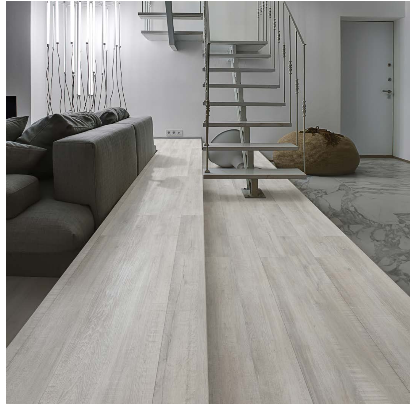
Forest perla 20x120 / 8"x48"